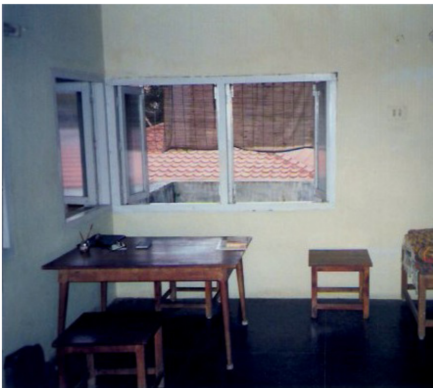
T.K.V. Desikachar's office where the interview took place.